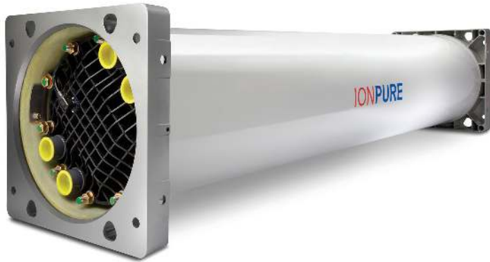
Ionpure® VNX Enhanced Performance High Flow Continuous Electrodeionization (CEDI) Modules